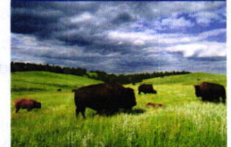
Wildlife enhances the pristine Black Hills