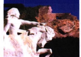
Crazy Horse Monument to be 10x the size of Mt. Rushmore