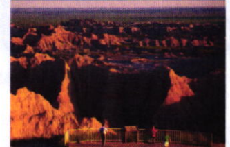
Spectacular Badlands National Park